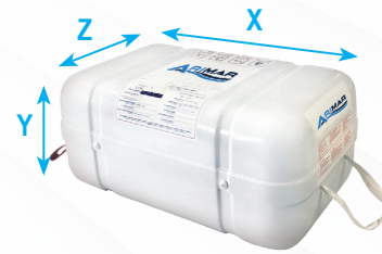
Flat Compact (ABS)