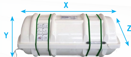
Roll Compact (GRP)