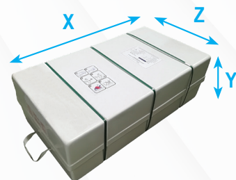
Flat Compact - 12 persons (GRP)